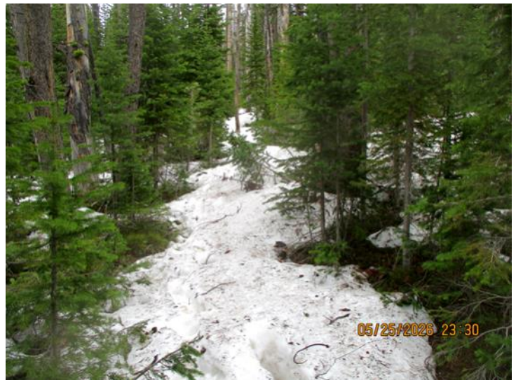
2nd Spring Clinic at Ron's